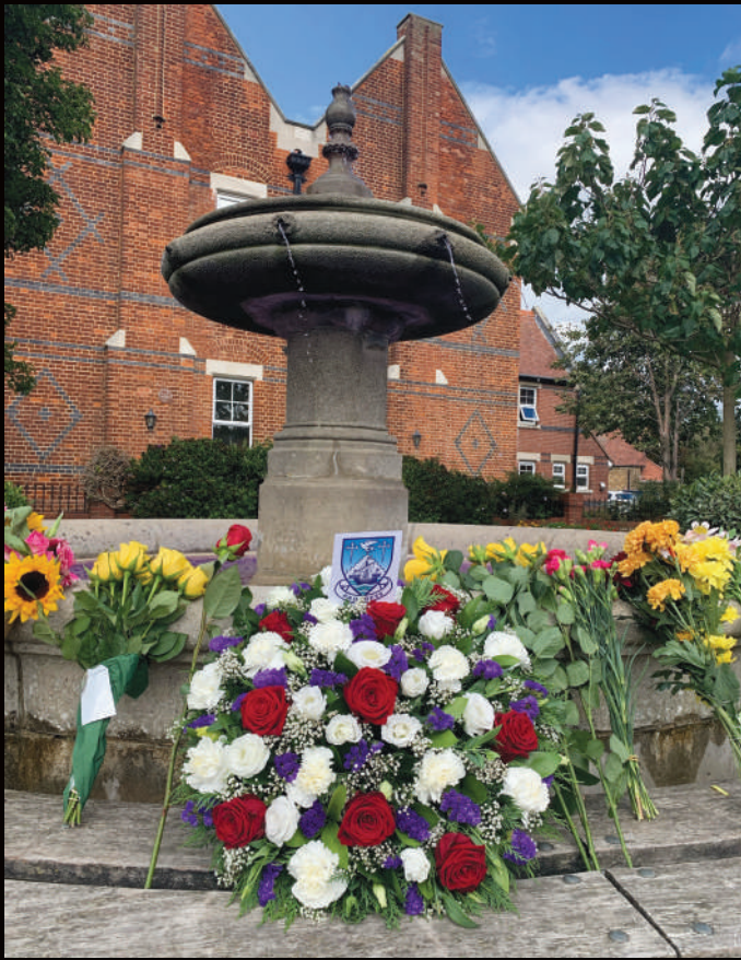
Floral Tribute Chennevieres Garden