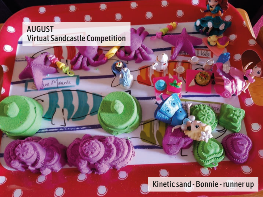
Kinetic sand - Bonnie - runner up