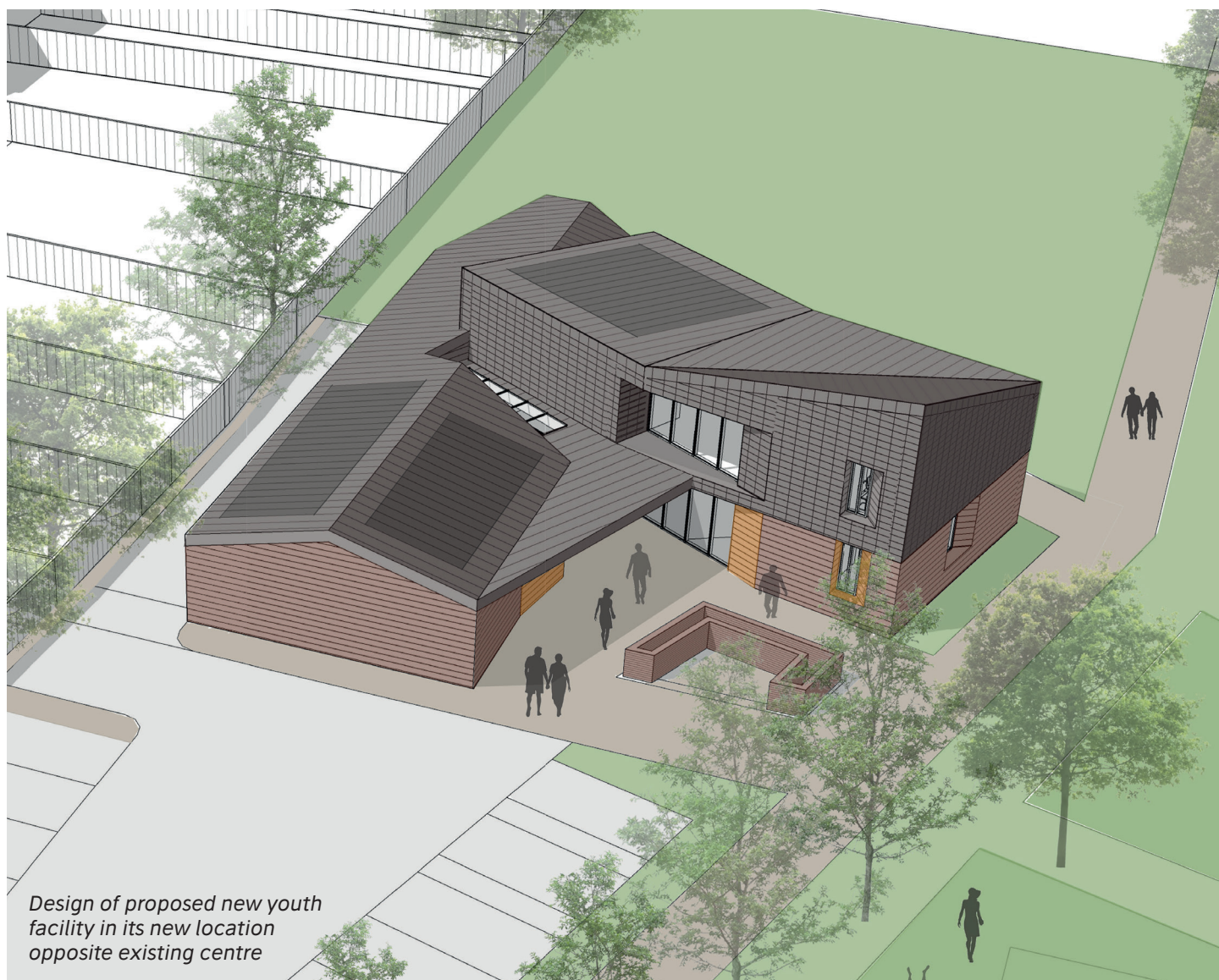
Design of proposed new youth facility in its new location opposite existing centre