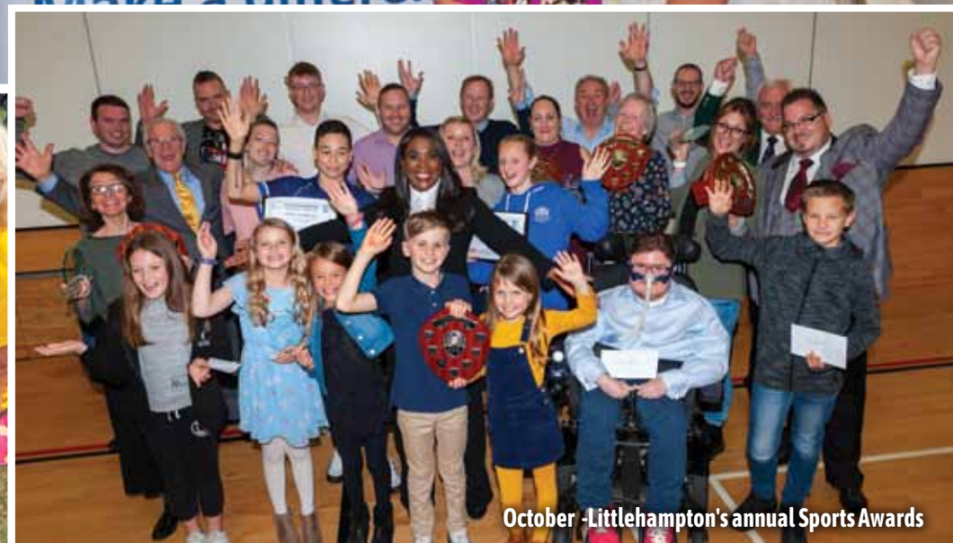
October - Littlehampton's annual Sports Awards