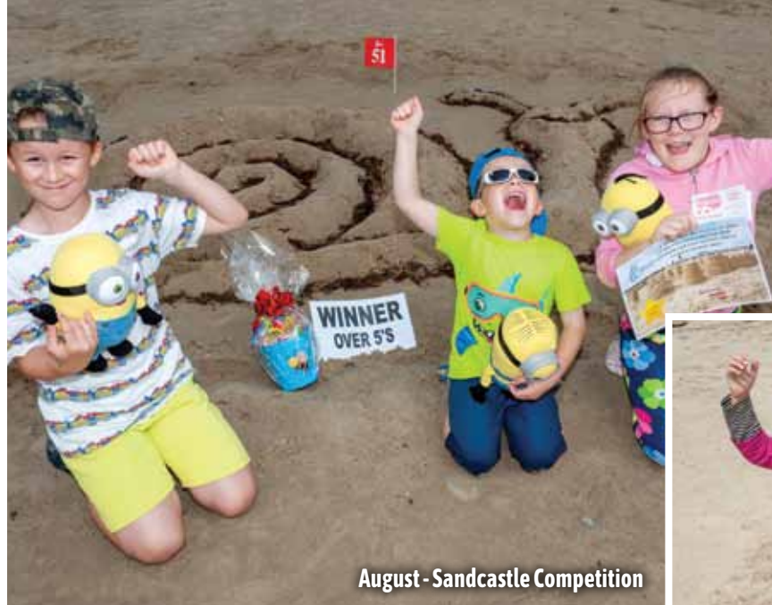
August - Sandcastle Competition