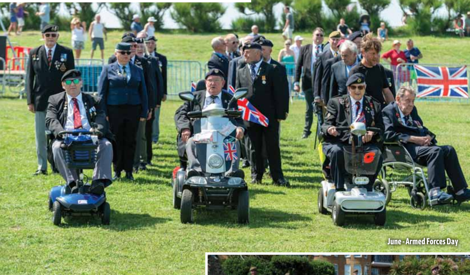
June - Armed Forces Day