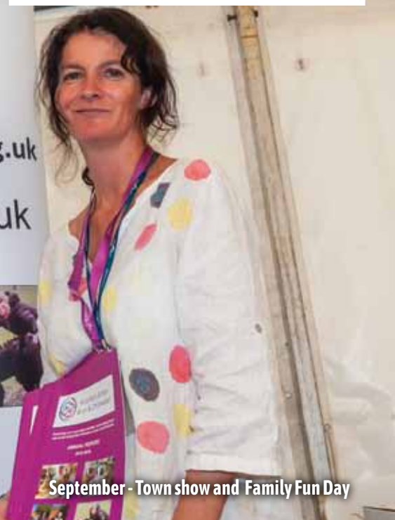
September - Town show and Family Fun Day