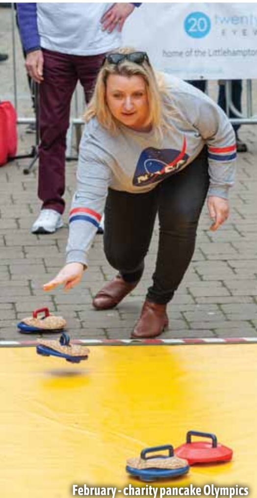
February - charity pancake Olympics