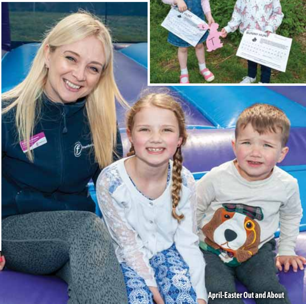
April - Easter Out and About