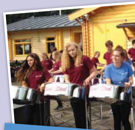
Sussex Steel performing in Amsterdam.

The closing date for applications is Friday 7th October . Application details, along with full criteria, can be found at www.littlehampton-tc.gov.uk . Successful applicants will be notified by early November.