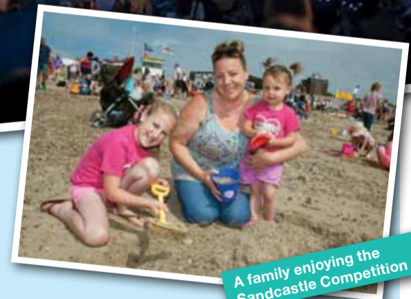
A family enjoying the Sandcastle Competition

Wick Week was another highlight. A fantastic community festival, Project 82, Arun Community Church, Wick Information Centre, New Highfields Residents Group and the Wickbourne Children and Family Centre collectively worked to offer a stupendous range of events and activities, including a hugely successful Soccer School, a family film night, Bingo, a Summer market and much more.