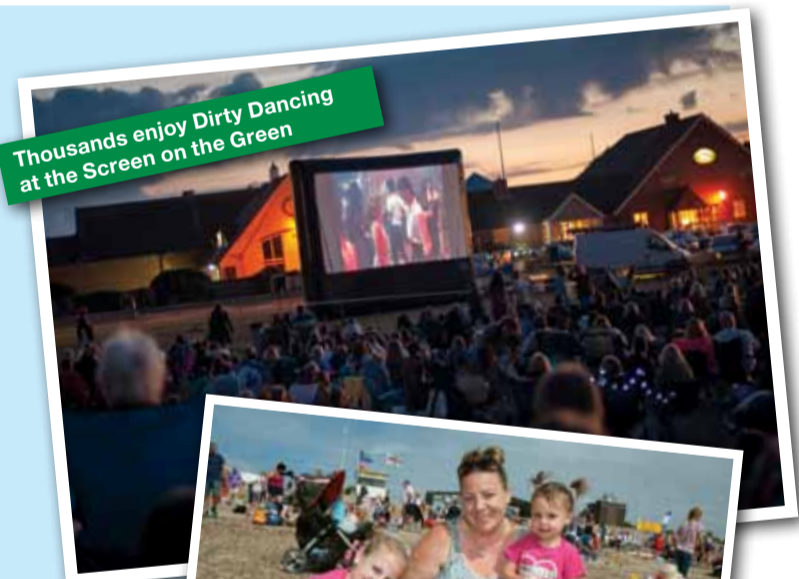
Thousands enjoy Dirty Dancing at the Screen on the Green