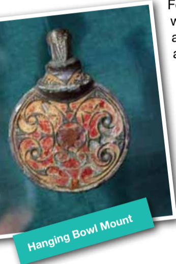
Hanging Bowl Mount